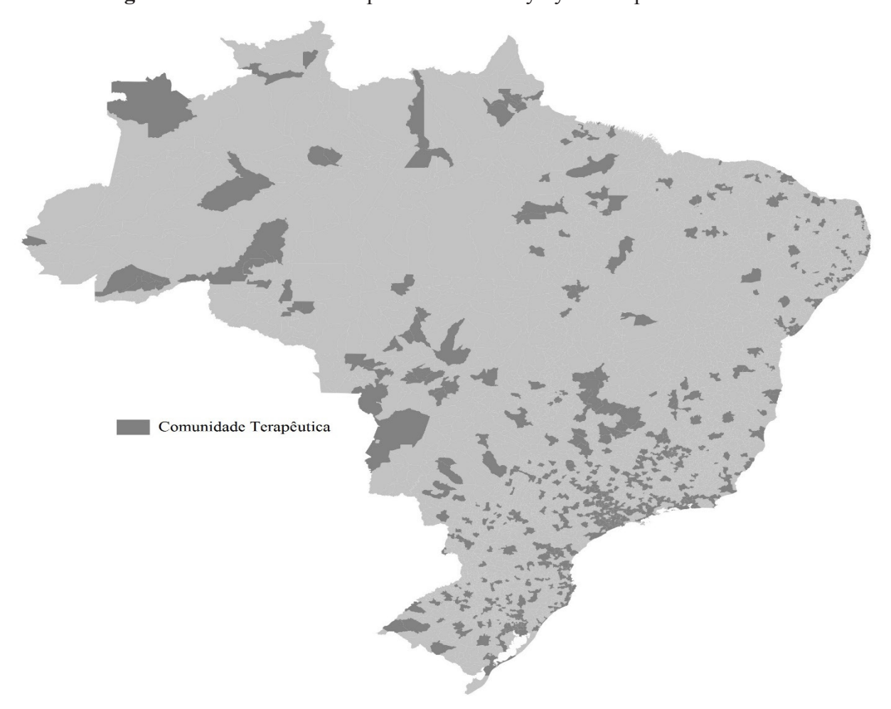
Image 1. Distribution of Therapeutic Community by municipalities in Brazil.

Overall there are over 1,863 Therapeutic Communities distributed in 713 municipalities, located, predominantly in the Southeast (41.7%) and South (25.6%) regions, in the municipalities of small (25.3%) and average size (25.2%), as shown in image 1. From the existing number, according with the Mental Health Technical Area/DAPES/SAS/MS, none of the services, until this point, had presented a proposal that matches a Decree no 131, of January 26, 2012, which regulates the permission for fostering people under the suffering caused by use of alcohol and other drugs. The funding has been given by the National Secretary of Drug Policy (SENAD) from the Ministry of Justice, via public notices.